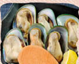
Mussels (4pcs) ムール貝