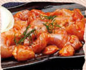
Chicken Thigh Fillet 鶏もも肉