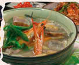
Seafood Noodle $12 海鮮麺