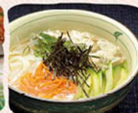
Sakae Onmen $10 サカエ温麺 Hot: Thin pulled wheat noodles in a mild and clear fish based soup with gyoza, egg and vegetables