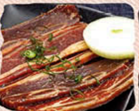
Beef LA Ribs (2pcs) LAカルビ