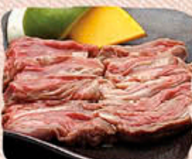
Beef Thin Skirt 和牛ハラミ