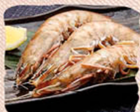
Prawn (3pcs) エビ