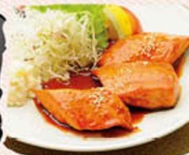
Teriyaki Salmon Steak (2pc) $18 照り焼きサーモン ステーキ Freshly grilled salmon steak with Sakae teriyaki sauce