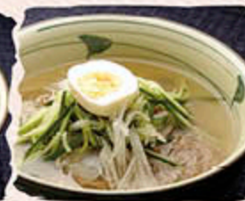
Mul Neng Myun/ Bibim Neng Myun/ Mul Bibim Neng Myun $10 冷麺 Sakae style Korean Ioe noodles. Buckwheat noodles served in an iced sweet vinegar base soup with egg, cold beef, pear and cucumber. A Korean Summer favourite