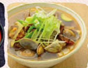
Asari Udon $12 アサリうどん Udon noodle in a soy sauce based soup with vongole and vegies