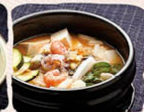
Miso Stew $10 味噌シチュー Fermented bean paste stewed with vegetables