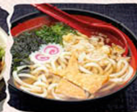
Udon $8 うどん Thick wheat noodles for hot pot