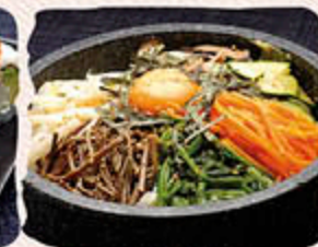
Dol Sot Bibimbap $13 石焼ビビンバ Earthen ware pot, filled with hot rice, covered with various vegetables, ferns, meat, sprinkled with sesame oil and seeds