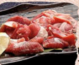
Chicken Giblets すな肝