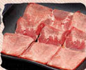
Ox Tongue 牛タン