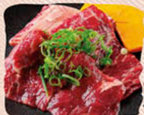
Beef Rib (1pc) 骨付きカルビ