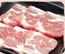
Pork Neck 豚首肉