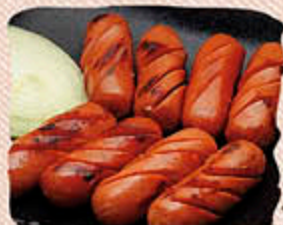
Sausages (4pcs) ソーセージ