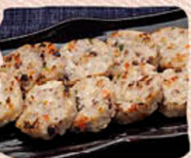
Mixed Seafood Balls (5pcs) 海鮮つくね