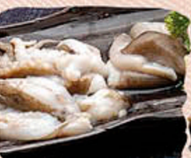
Baby Octopus イイダコ