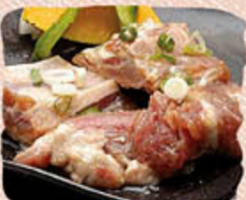
Pork LA Rib (2pcs) 骨付きばら肉