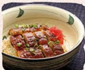
Una-Don $16 うな丼 Grilled teriyaki eel atop fresh boiled rice with miso soup