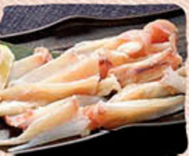
Chicken Cartilage 軟骨