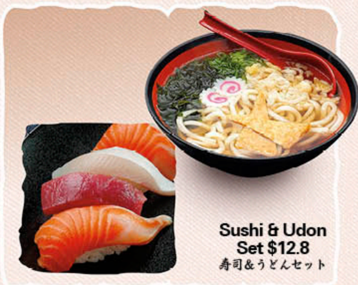
Sushi & Udon Set $12.8 寿司&うどんセット