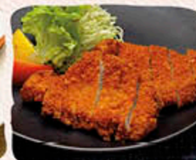
Tonkatsu $12 とんかつ Deep fried pork fillet served with katsu sauce and salad