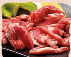
Wagyu Rib Fingers 和牛中落ちカルビ