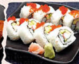
California Roll $12 カリフォルニアロール Flying fish roe, egg, avocado and cucumber