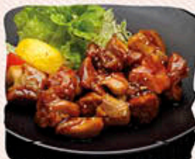
Teriyaki Chicken $12 照り焼きチキン