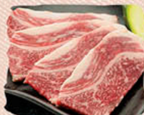
Wagyu Brisket 和牛肩ばら