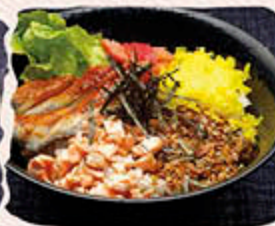
Furikake Don $13 ふりかけ丼 Dried fish, seafood, sesame seeds, salmon and eel flakes on top of rice with a touch of Teriyaki sauce