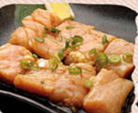
Beef Tripe 特上ミノ