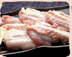
Chicken Wings (3pcs) 手羽先