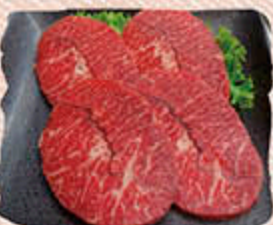
Beef Oyster Blade