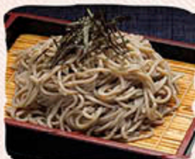
Mori Soba $10 盛りそば Chilled buckwheat noodles with cold Sakae Tsuyu Dipping Sauce