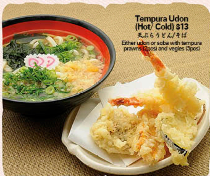
Tempura Udon (Hot/ Cold) $13 天ぷらうどん/そば Either udon or soba with tempura prawns (2pcs) and vegies (3pcs)